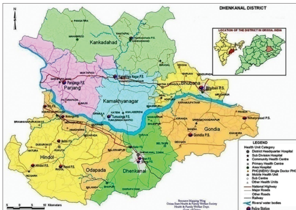
Fig. 1: Map of Dhenkanal district of Odisha

agar (PDA) slants which were kept in a refrigerator for further using during experimentation.